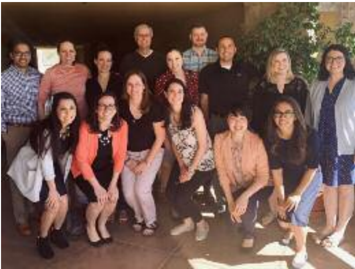
TECaN Executive Council at Scottsdale Workshop

early career physicians that aren't covered in our formal education. We hope to release new podcasts every 2-3 weeks and are open to suggestions for content. We welcome ideas and requests at our general TECaN council email, tecan@aap.org .